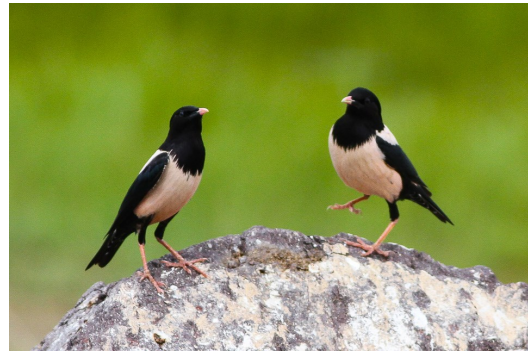
Rosy Starlings

18 June: I had hoped to have more information for you on the birds in and around the village but now they have paired up and are rearing their young, although still here, they are far too busy. My thoughts are that as we have had good weather, some species may be rearing a second brood.