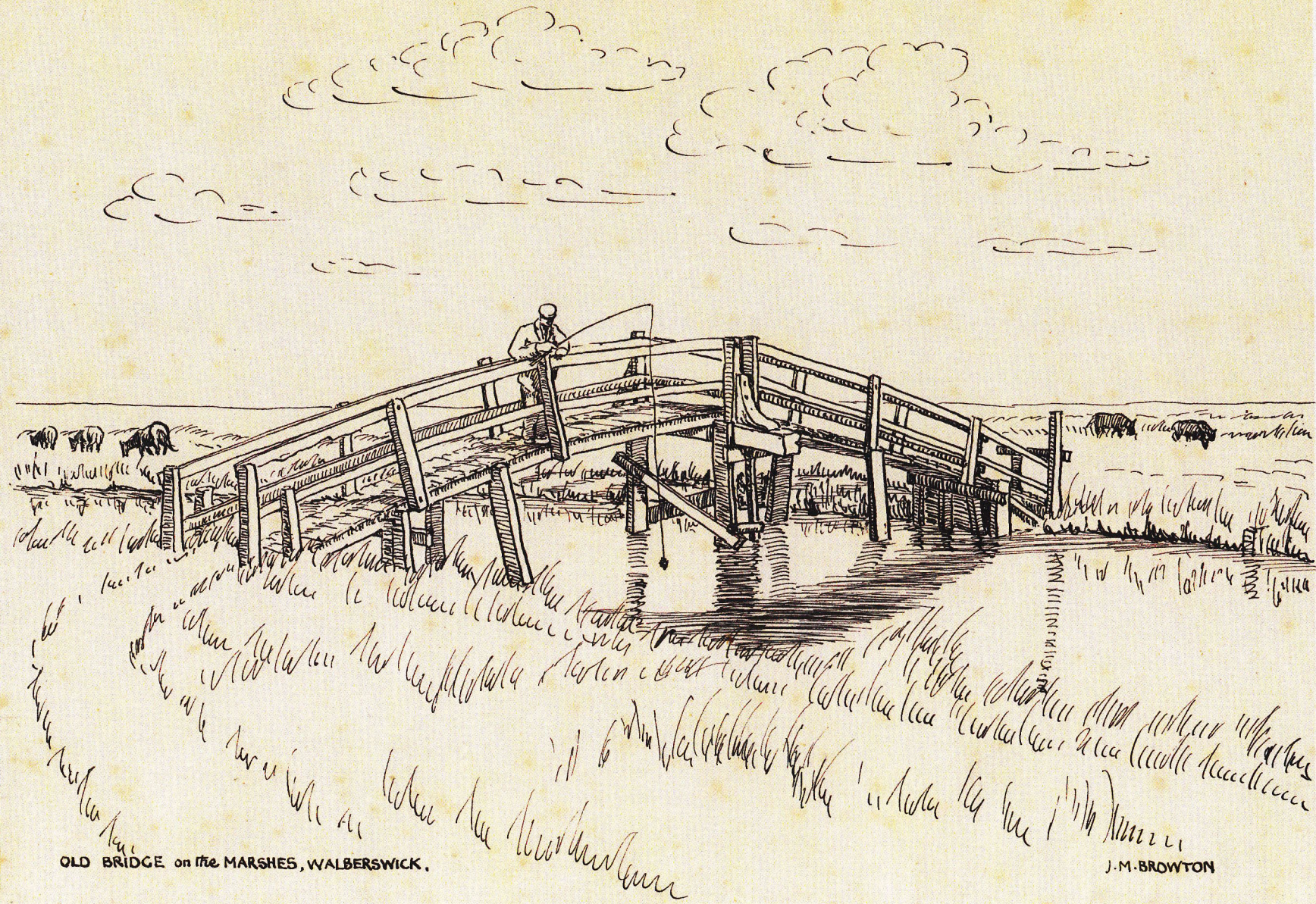
OLD BRIDGE on the MARSHES, WALBERSWICK.